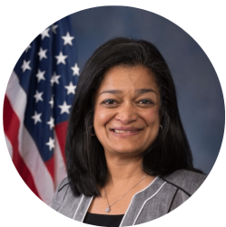
Congresswoman Pramila Jayapal (WA-07)